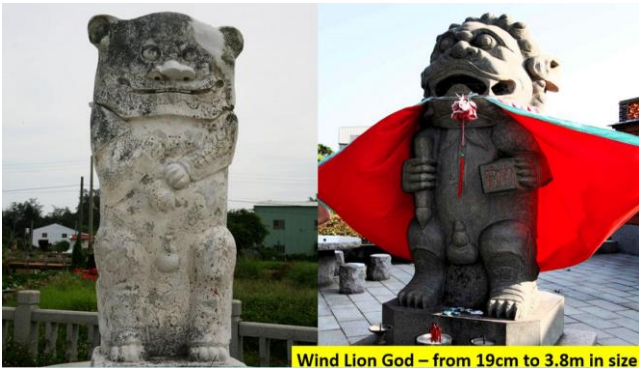
Wind Lion God – from 19cm to 3.8m in size

4 MAGGIO 2025- PRIMO GIORNO: TAIPEI –KINMEN-XIAMEN – VOLO DA SONGSHAN A KINMEN – VIAGGIO IN TRAGHETTO FINO A XIAMEN